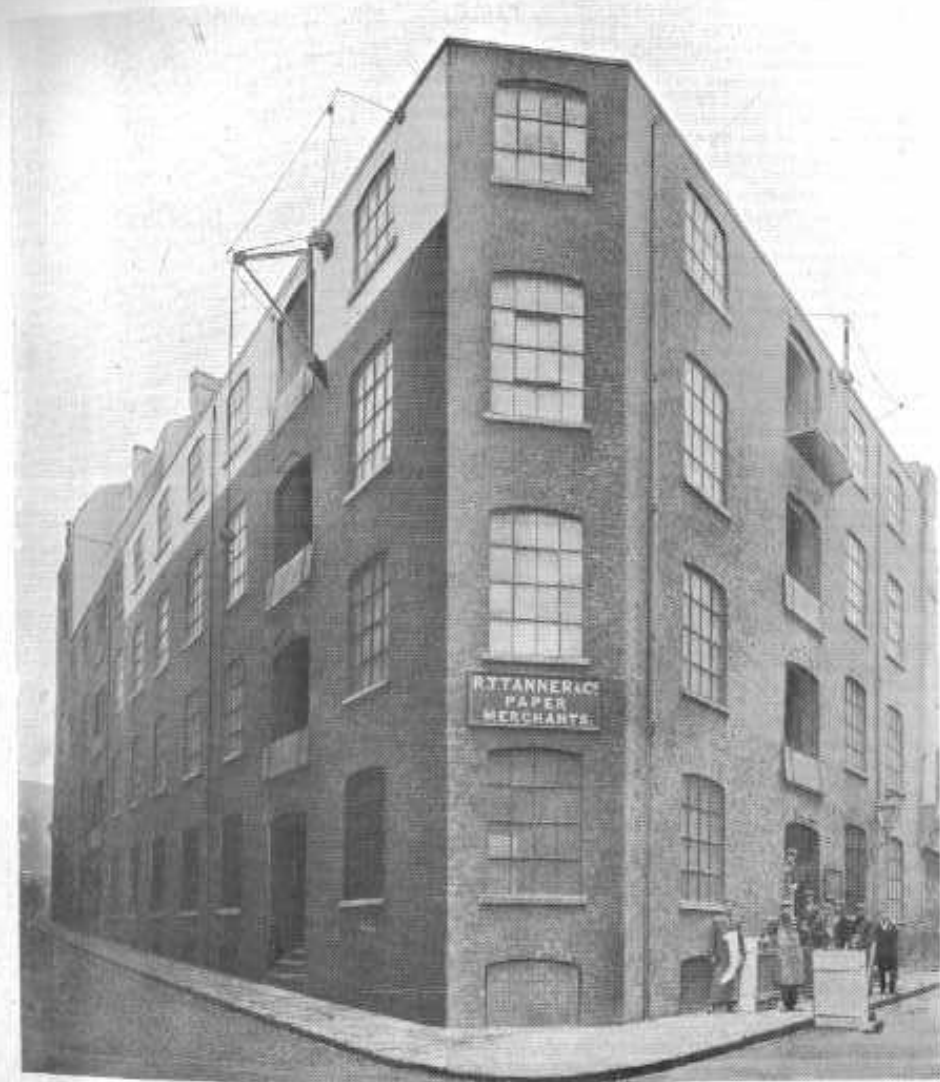
Warehouses and Stock Rooms, Hutton Street, & Primrose Hill, Whitefriars, E.C.