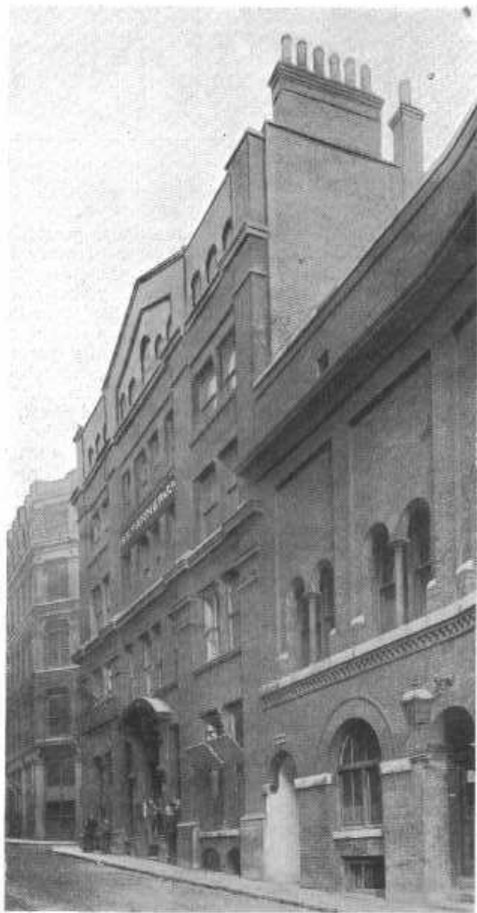
Offices and Warehouses, Dorset Street, Salisbury Square, E.C.